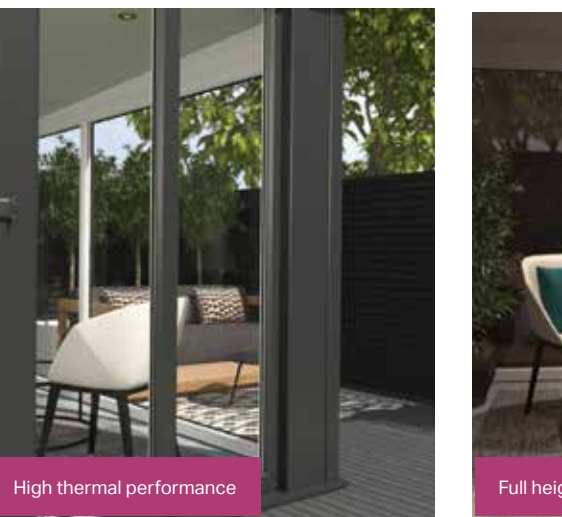
Beautiful, Energy Efficient Garden Rooms from Ultraframe