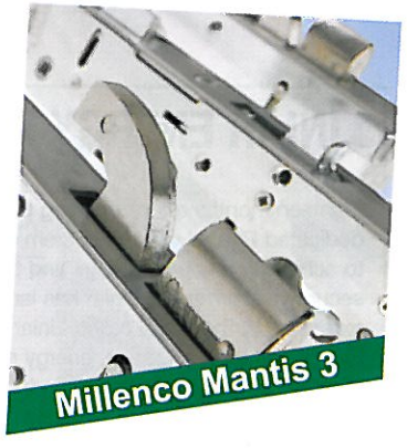
Millenco 3 and Mantis 3 (shown) are high quality multi-point single and double door locks suitable for PVCu, timber and composite door types. They offer extra security, when used in 'Standard' and 'High Security' versions, or 'Standard' and 'High Security' versions to meet fire door requirements for single or double doors. The standard face plate finish is a sleek 'brushed' aluminium. Other finishes are available upon request. All materials and processes are certified security and tested, to recognised security standards and the British Standards BS 3622. Please visit the VBH website to see the features in detail, and call us for a complete quote.

tapered dead bolt and hook combinations, and the strength during testing. This gave us the confidence to